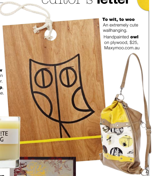
To wit, to woo An extremely cute wallhanging. Handpainted owl on plywood, $25, Maxymoo.com.au