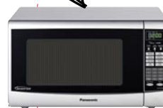
Answer to win! Q: Why do you need a microwave this Christmas?

Tell us in 25 words or less and you could win one of three Panasonic microwaves (pictured), worth $359 each. See page 160 for entry details.