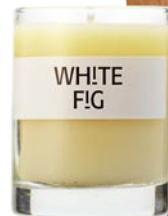
Slow-burning love An Archipelago Botanicals delectable soy wax blend. White Fig candle , from $42.95, Kit Cosmetics.