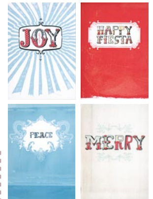
In a word A simple sentiment says it all! Big Words Christmas cards , $6.95 each, Raven & Lamb.