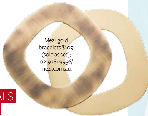
Mezi gold bracelets $109 (sold as set); 02-92819956/mezi.com.au.