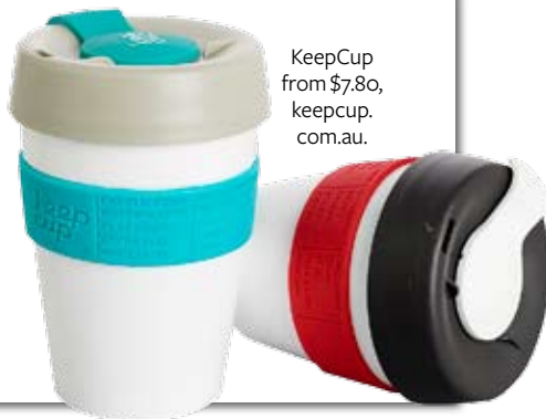
KeepCup from $7.80, keepcup.com.au.

It may come as a surprise to learn your morning takeaway coffee cup is not recyclable. Each one goes to landfill. That's where KeepCup comes in—a reusable cup designed in standard café-coffee sizes (236ml, 354ml and 473ml). Made in Australia, it's microwave and dishwasher safe. Stylish, practical and sustainable.